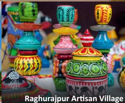
Raghurajpur Artisan Village