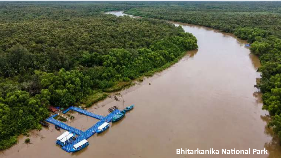
Bhitarkanika National Park