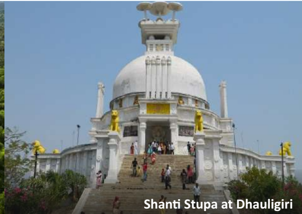
Shanti Stupa at Dhauligiri