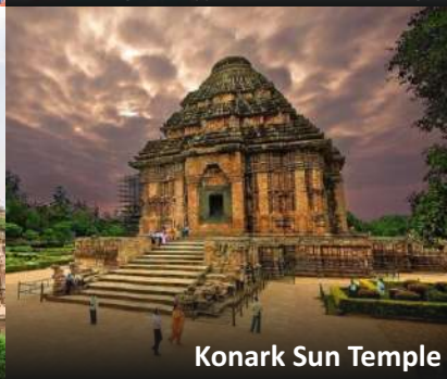
Konark Sun Temple